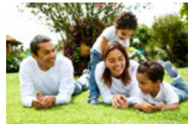
Natural Family Planning, Love, Mercy, Life, opening the heart of marriage.

Want to learn a method of Natural Family Planning in a class within our Diocese? Please visit the Diocese of Orange website: http://rcbo.org/resources/natural-family-planning/